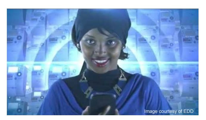
600,000 EDD customers will benefit from Smart Meters

communications infrastructure for meter management, which is being rolled out to 41,000 delivery points.