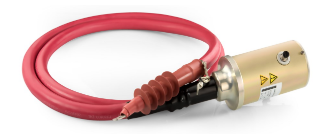
Medium Voltage Coupler BPL 24CC

Rigorous testing of the BPL in the medium voltage grid showed 100 reliability in getting the data from the meters to the management platform.