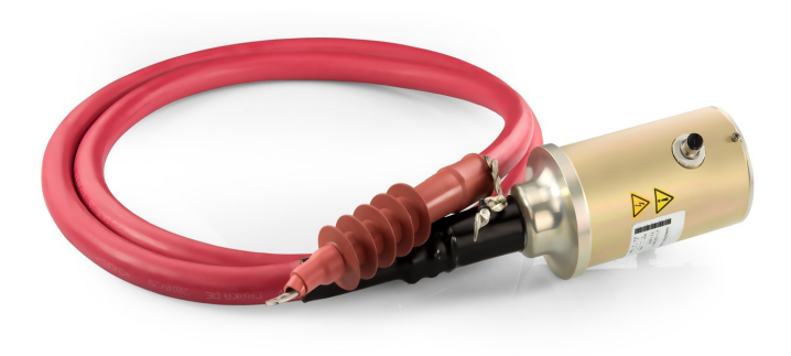
Capacitive Coupler BPL 12CC